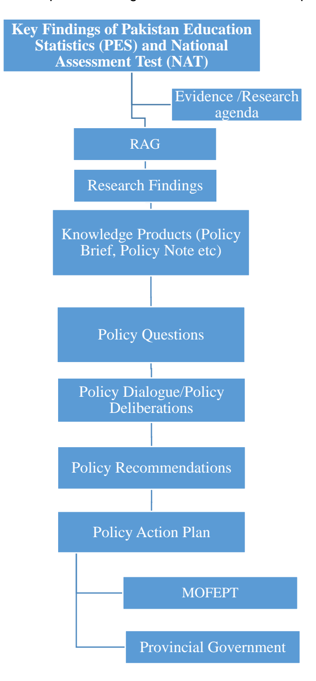
Figure 2: Research Process Mapping at PIE